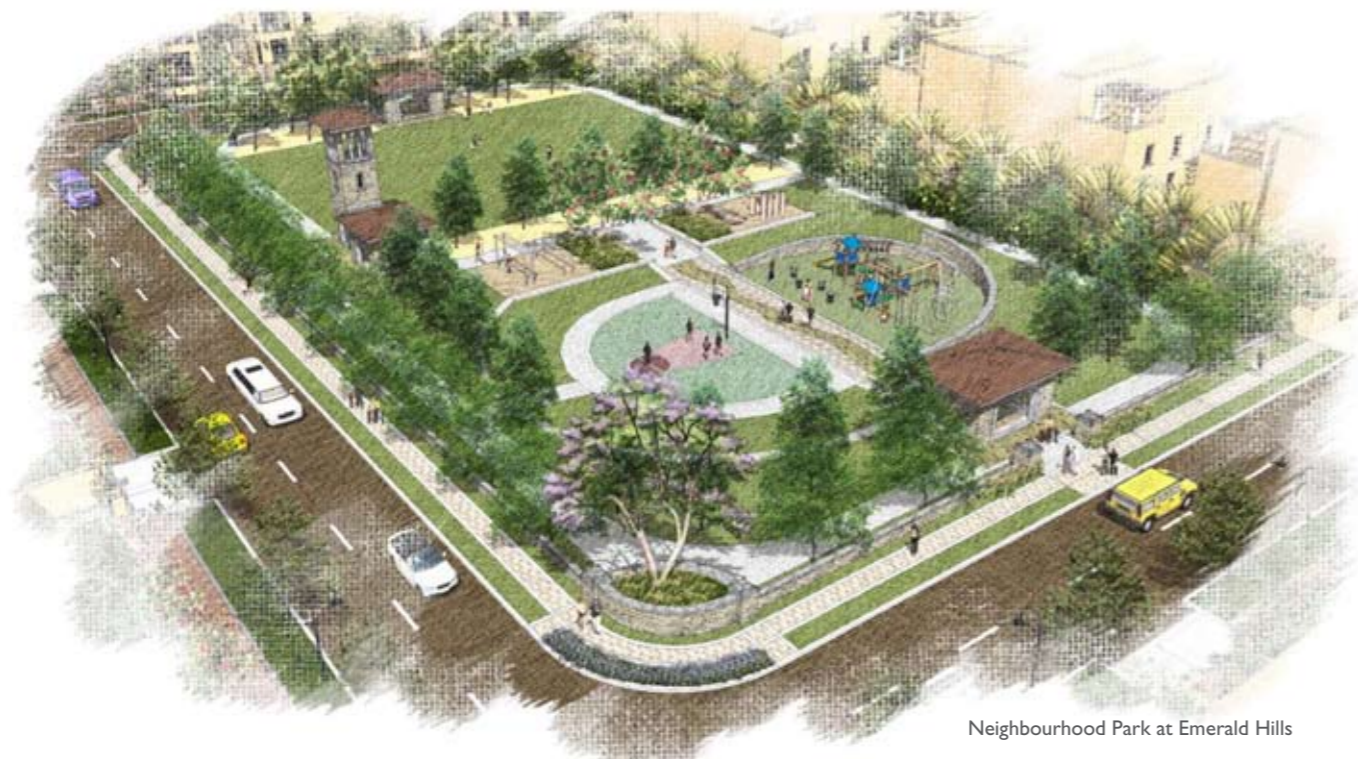
Neighbourhood Park at Emerald Hills

1 sq. mtr. = 1.196 sq. yds. & 1 sq. mtr. = 10.76 sq. ft. In the interest of maintaining high standards, all floor plans, layout plans, areas, dimensions and specifications are indicative and are subject to change as decided by the company or by any competent authority. Soft furnishing, cupboards, furniture and gadgets are not part of the offering.