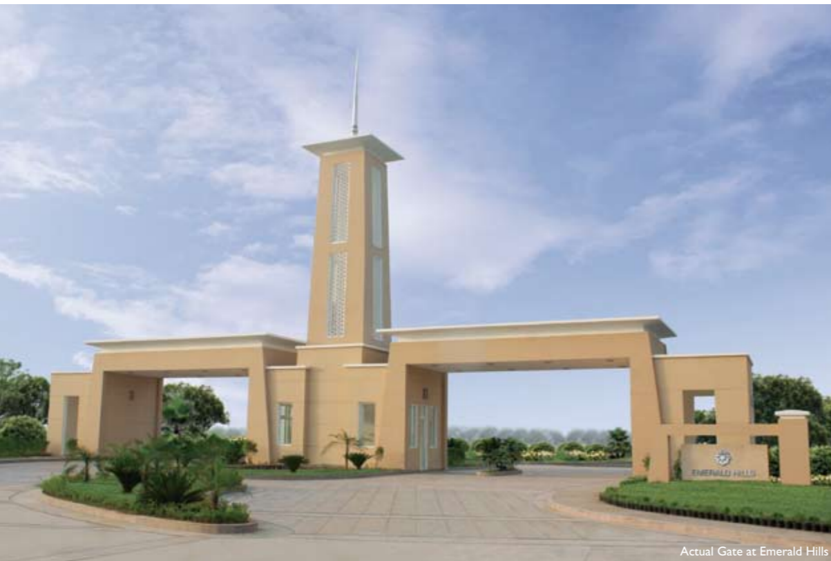
Actual Gate at Emerald Hills

Presenting 'Exclusive Plots' at Emerald Hills. Because an exclusive lifestyle needs an exclusive address.