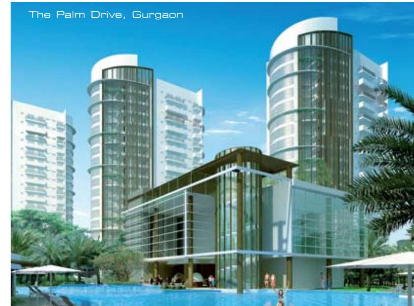
The Palm Drive, Gurgaon

India's premier real estate and infrastructure development company, Emaar MGF has brought in one of the largest FDI in the Indian real estate sector and is engaged in pan-India projects in the Residential, Commercial; IT Parks & SEZs, Retail, Hospitality, Healthcare and Education sectors.