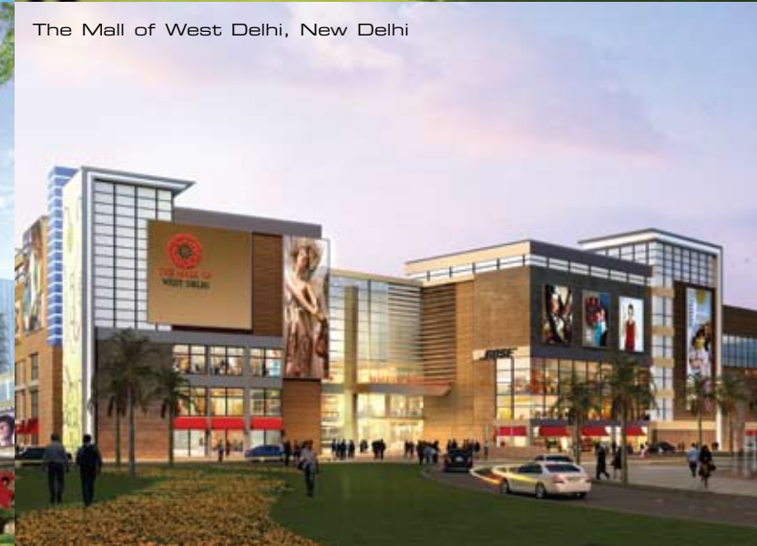
The Mall of West Delhi, New Delhi