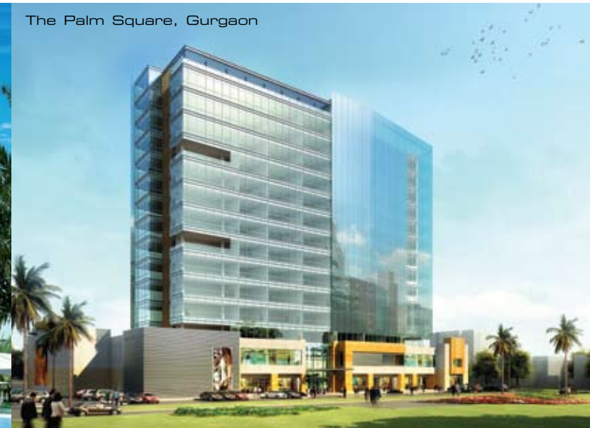
The Palm Square, Gurgaon