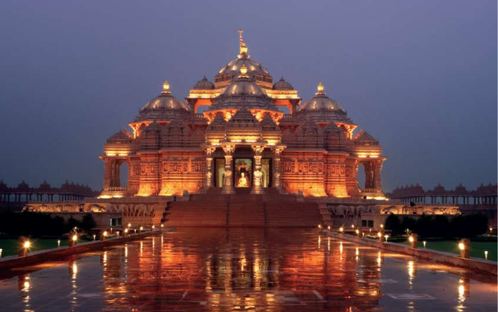
Akshardham Temple, Delhi