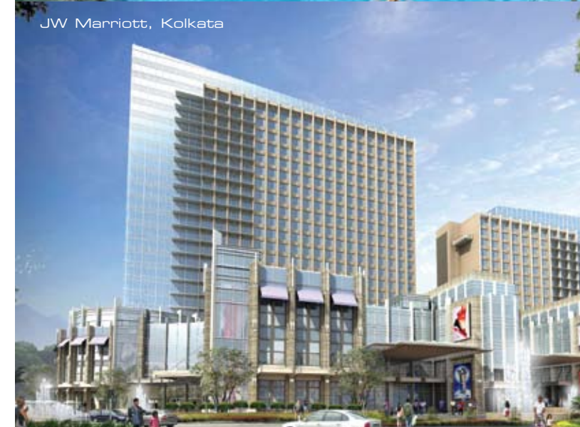
JW Marriott, Kolkata